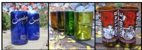
Bottlehood's designs Los Angeles Times food blog